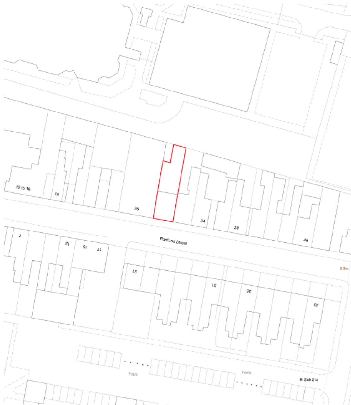
Site location plan